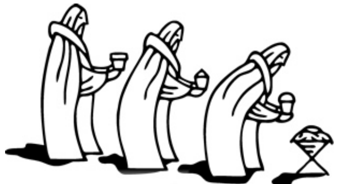
The Magi bring gifts